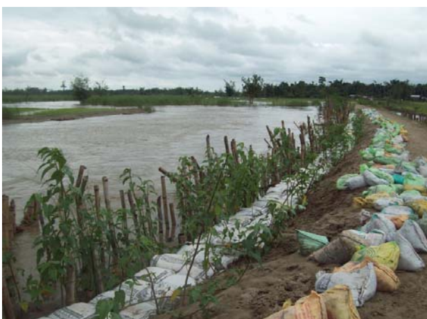
Channels shift so abruptly in Dhemaji that the entire district can be considered a flood plain of a river. Bunds are being used as a flood protection measure here through support of RVC and NREGA programmes.

“A government estimate says about four lakh hectare agricultural land - 7% of the state’s 78,523 sq km area - has been lost due to erosion since the 1950s. As a result, pressure to expand cultivation area is mounting in