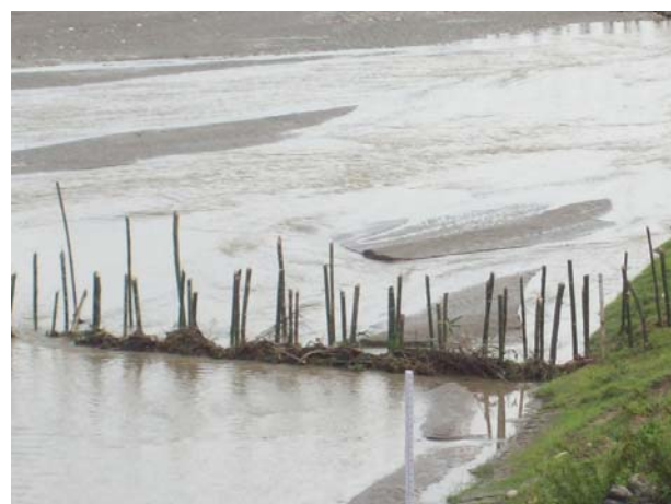
Constructing bamboo porcupines is common as a flood protection measure in Dhemaji on river Subansiri