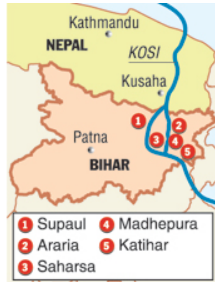
Table 1: Effects of floods of 2008

While as many as 18 districts of the state were affected by the unforeseen disaster, the districts of Supaul, Araria, Madhepura, Saharsa and Purnea (ref. diagram on the right) were amongst the worst hit, causing losses and damages of an unprecedented scale. According to a Daily Report issued on September 23, 2008 by Deputy Secretary, Department of Disaster Management, as many as 2528 villages drawn from 114 blocks of 18 districts of Bihar were affected by the floods, affecting 47 lakh people and resulting in deaths of 235 humans. Key contents of the aforesaid Report are reproduced in Table 1: